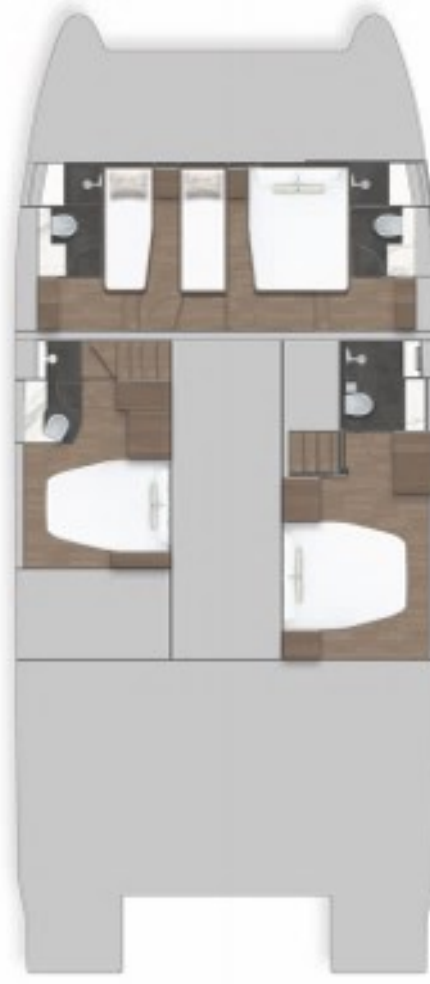
4 CABINS (OPTIONAL)