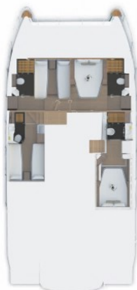
4 CABINS (OPTIONAL)