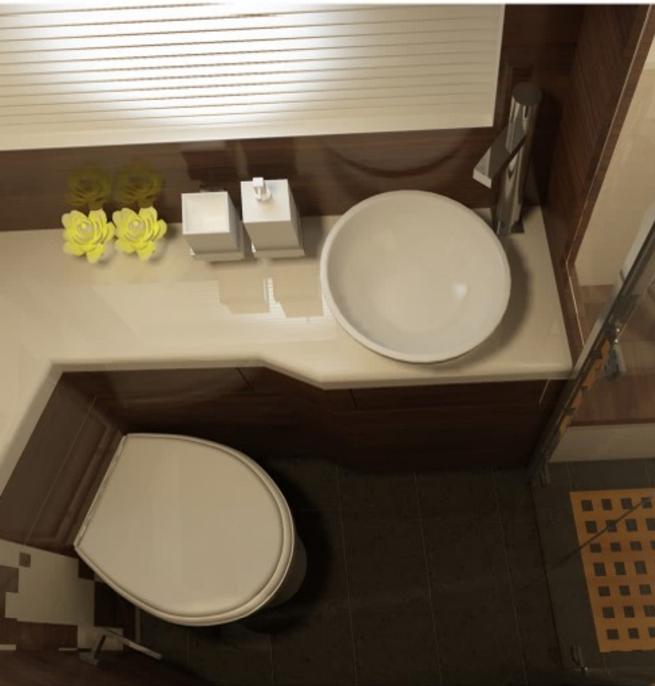
Guest Cabin En-suite